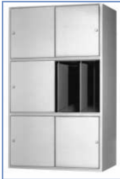
853 Three shelf Vertifile with doors