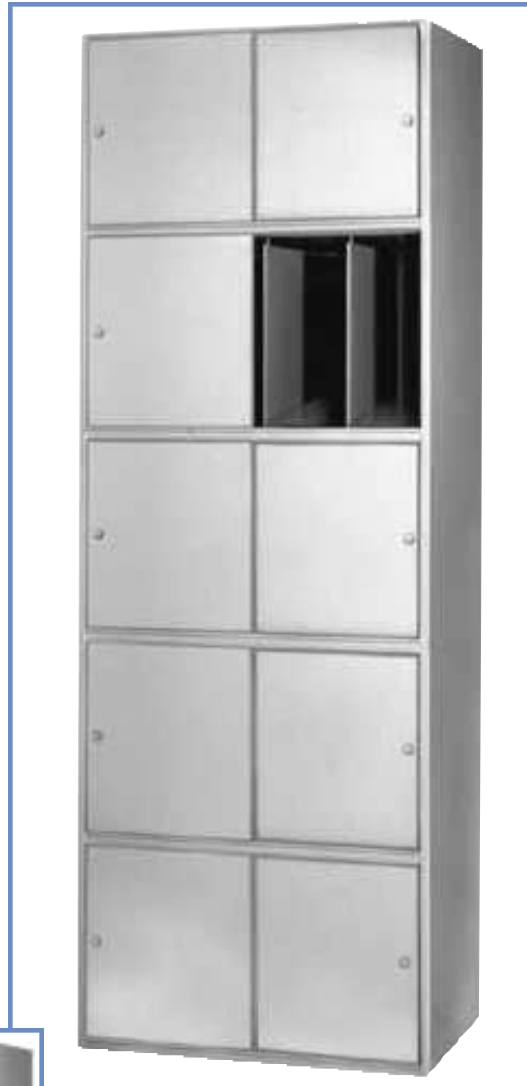
855 Five shelf Vertifile with doors