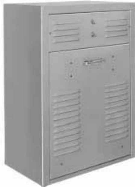
12 Film Dryer WIDTH HGT DEPTH 22.5" 33" 15" With Base 36.5" High