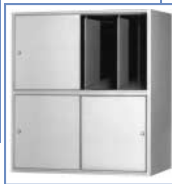
852 Two shelf Vertifile with doors