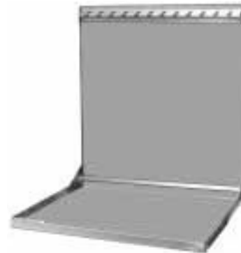
174A - Folding Drying Rack approx. shipping Wt. - 13 lbs.

The Folding Drying Rack, constructed entirely of polished Stainless Steel, holds twelve 14"x17" hangers. A solid Stainless Steel back protects the wall at all times and the 20" x 17" tray can be folded up against the back for extra convenience when not in use. It can be mounted quickly and easily in any location. The rack is 23" high, 20" wide and 17" deep with the tray in the open position.