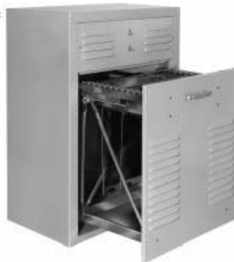
15 Film Dryer WIDTH HGT DEPTH 22.5" 33" 24" With Base 36.5" High